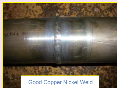
Good Copper Nickel Weld

Repair was successfully completed within the vessel's port stay of 20 hours.