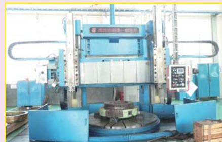
CNC Vertical Lathe