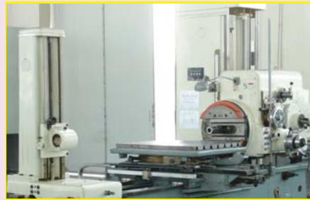
Horizontal Jig-Boring Machine