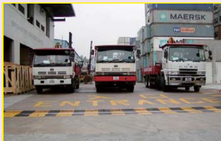
Trucks (Logistic section) for transportation of parts