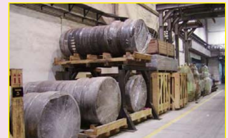
Part storage service for customers

Together with our Logistic team providing part storage and transportation services, the recondition workshop provides one-stop-shop services to our customers. Once a repair request is sent out, their parts will be safely picked up from vessel, reconditioned and then returned to the vessel at the next call.