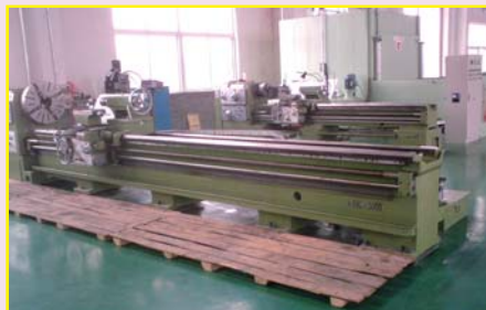
CNC Horizontal Lathe