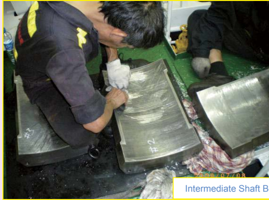
Intermediate Shaft Bearing Shell Replacement