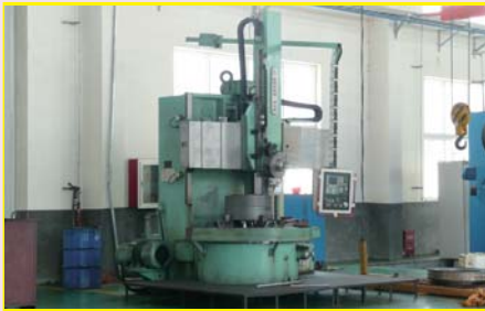
CNC Vertical Lathe

In order to cater for the growing demand of marine reconditioning in Hong Kong, we have consolidated the Shanghai and the Hong Kong workshops into one. The new machines from Shanghai recondition workshop have been moved to Hong Kong. Together with the new cutting edge machines originally in Hong Kong, we're able to fulfill the highest demand of recondition the latest model of engines and this strengthened Brigantine Hong Kong workshop's leading position in Asia.